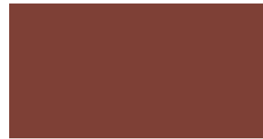
RUSTIC RED TSR 0.27